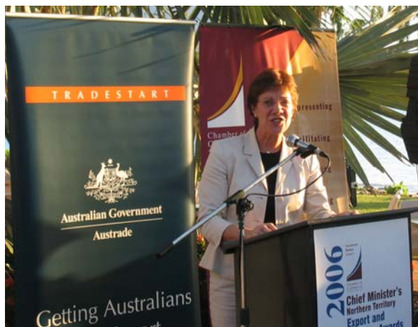
Left: The Chief Minister Officially launches the awards at the Darwin Sailing Club.